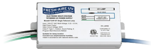
"ST" 110-277 VAC