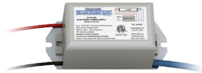
"ER" 18-24 VAC