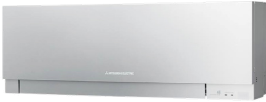
Indoor Unit: MSZ-EF18NAS