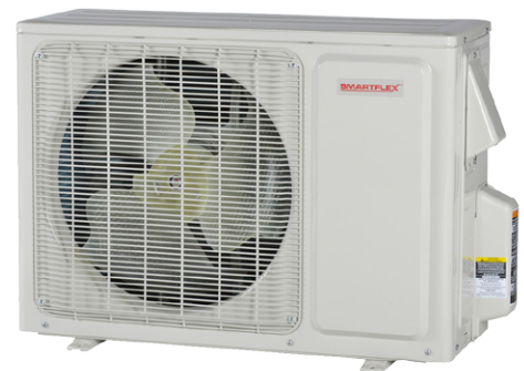
208/230V 9K-24K BTU/H INVERTER-DRIVEN HEAT PUMP SYSTEMS