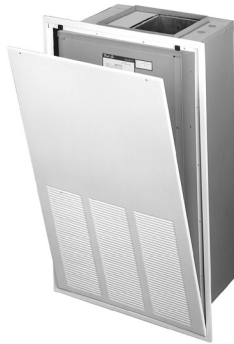
Unit shown with louvered wall panel (Recessed wall application)