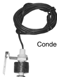
Condensate Overflow Switch #SS3