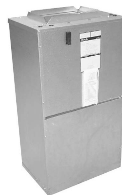
Unit shown with optional bottom return air kit (#90PK4 or #90PK5)