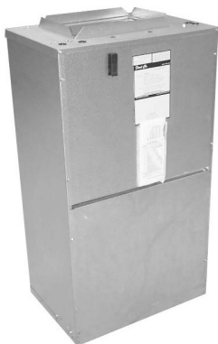
Unit shown with bottom return air cover (Closet application - Bottom Return Air)

The UC series is designed as an upflow indoor air handler for use with today's higher efficiency split-system heat pumps or condensing units.