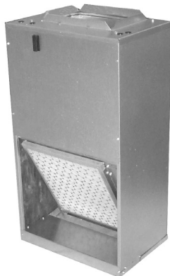
Unit shown without wall panel (Closet application - Front Return Air)