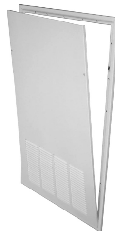
Optional wall panel (Recessed wall application)