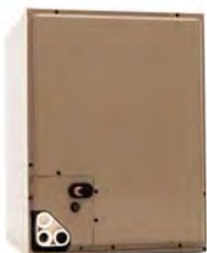
UPFLOW/DOWNFLOW FULL CASED CF