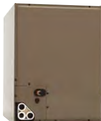
FULL CASED MULTI-POSITION CM