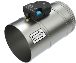
Order as a complete damper