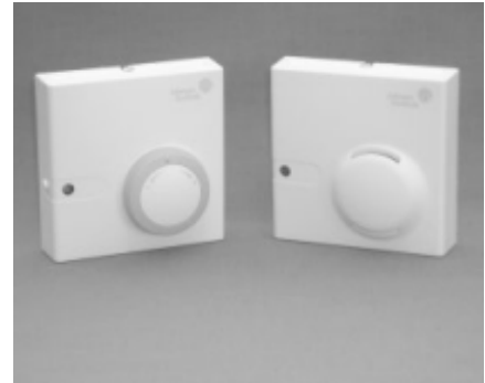
TE-6800 Series Temperature Sensors

If the TE-6800 Series Temperature Sensor fails to operate within its specifications, replace the unit. For a replacement sensor, contact the nearest Johnson Controls® representative.