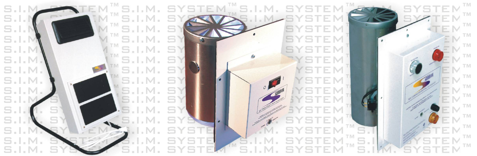
P1250X Portable UV Air Purifier**

All the benefits of Sanuvox's patented SIM System™ Technology in a portable air purifier weighing only 13 lbs. The P1250X uses Sanuvox's split UV-C / UV-V (germicidal / oxidizing) lamp to destroy biological and chemical contaminants including chemical odors, bacteria, cigarette smoke, mold, allergens, viruses, pet dander, etc. The P1250X is perfect for Allergy Sufferers, breaking down contaminants so they're easily absorbed into the body. The P1250X can be used continuously or when the need arises. Easily transported and available with an optional stand, the P1250X is ideal for anyone in need of a cost effective, solution for problems associated with indoor air quality.